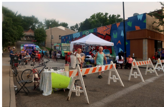
First Friday on Kenmore Blvd

This year starts the seventh season of Kenmore First Friday events on Kenmore Boulevard, and you can participate. If you want to set up a booth and promote your business to the residents of Akron, please contact the Better Kenmore CDC at jgippin@betterkenmore.org or www.betterkenmore.org .