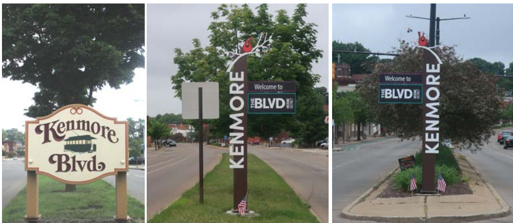
On the far left is one of the Previous Kenmore Boulevard Signs. Center & right are the new East & West Signs on Kenmore Boulevard.

It has been awhile since Kenmore Boulevard had it’s welcome signs. The earlier versions were both damaged by motor vehicles, but now, thanks to Kenmore Chamber member Better Kenmore (formerly the Kenmore Neighborhood Alliance ), we now have two beautiful new signs to welcome visitors to the Kenmore Historic Business District!