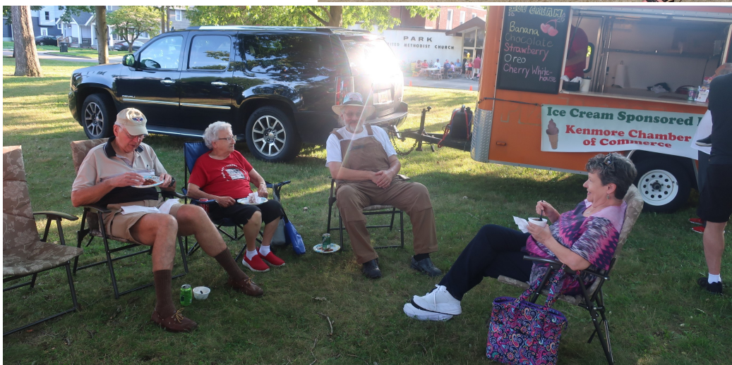
KCOC members at the Ice Cream Social at Shadyside Park concert, next to the stand that gave away free ice cream courtesy of KCOC