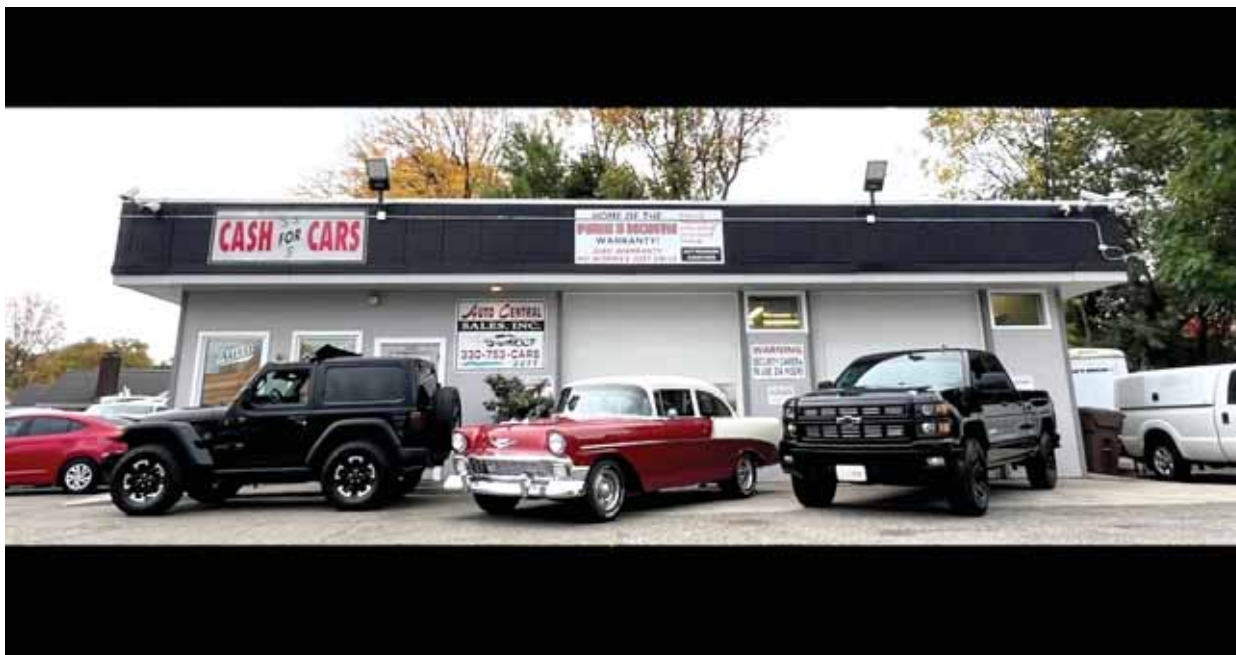
Auto Central, Located at 2401 Manchester Road

Auto Central is open 9:00 am to 6:00 pm Monday thru Friday, and 9:00 am to 2:00 pm on Saturday, closed Sunday. They can be reached at 330-753-2277 for sales or 330-724-2772 for service questions. And you can check out their inventory online at www.autocentralcars.com .