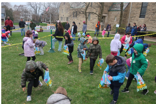
The Hunt for Eggs is On