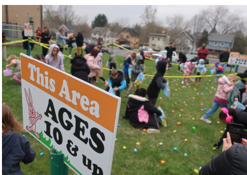
Areas Divided By Age