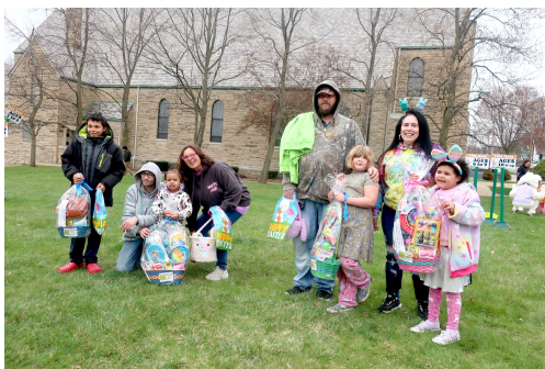
Special Gift Basket Winners