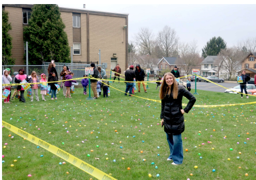
Our Councilperson Ready to Say "GO"