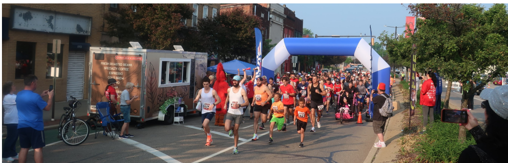
The Kenmore Cowbell 7K Race Begins on Kenmore Boulevard