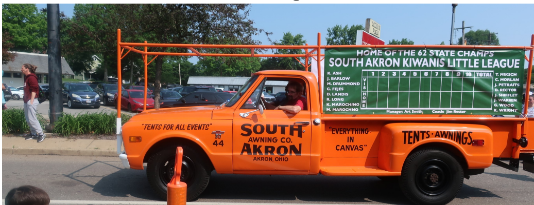
KCOC Member South Akron Awning in the Parade