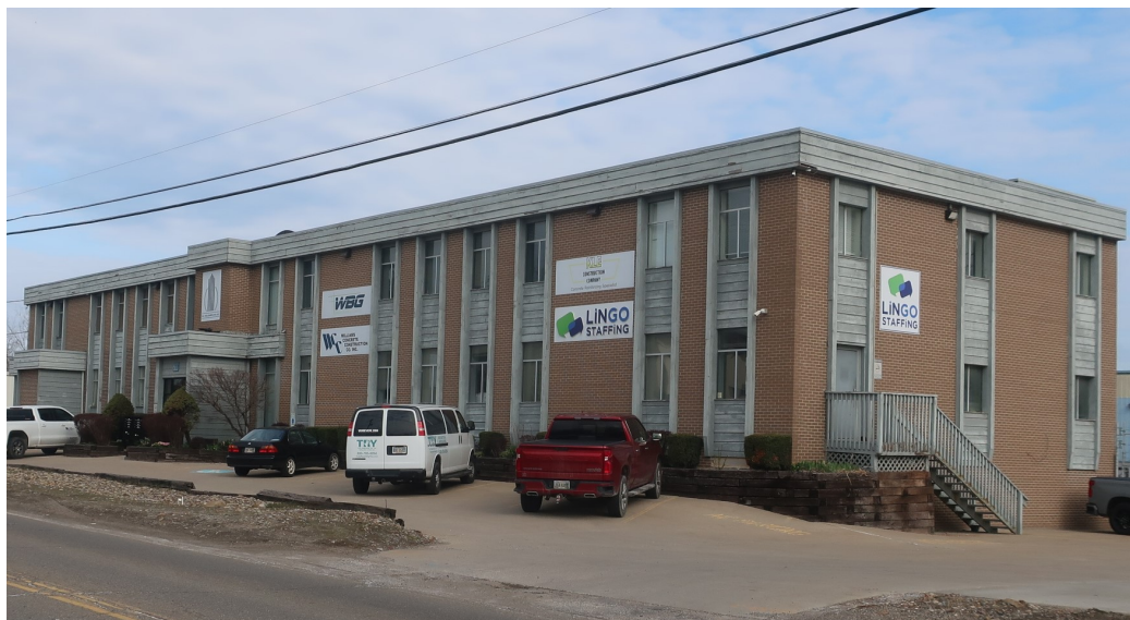
Lingo Staffing, Located at 753 West Waterloo Road

We hope you will join us on April 16th to network, connect, and see how we can work together to strengthen our local workforce.