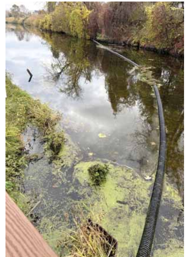
A Before (left) and After (right) Look at Summit Lake, Demonstrating How Successful a Breakaway Trash Boom Works