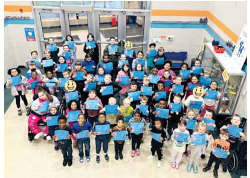
Sam Salem Students With Perfect Attendance

We are extremely proud of each of these students and grateful for the families and teachers who encourage them daily. Their effort truly makes a difference, and we look forward to celebrating even more attendance success in the months ahead.