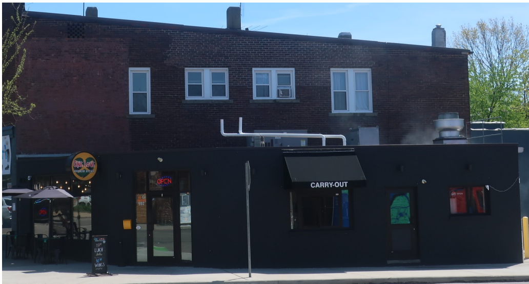
One Love Karibbean Kitchen, Located at 992 Kenmore Boulevard

This evening networking meeting will include your choice from many of the wonderful meals with that real island flavor, plus drinks, cookies from Reeves Cake Shop , and fun conversation with your fellow business members. Many $25 Gift Certificate door prizes from Kenmore Chamber members will also be given away. It is from 5:00 to 7:00 pm, and no RSVP is necessary. We hope to see you there!