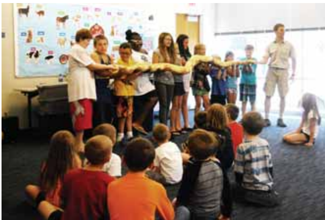
Holding Spongebob the Python at the Outback Ray Show

September 1 to 22 and October 13 thru November 24 Join us for stories, music, movement and fun! Each session is followed by a play time or fun activity. For children ages 2-6 years with a favorite adult. Call 330 745-6126 and register to join the fun.