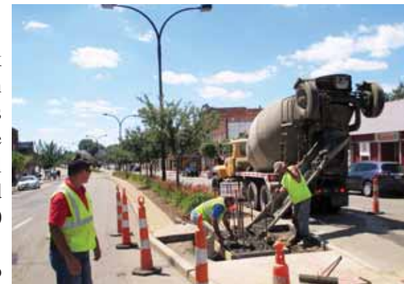
Building the Clock Tower Foundation