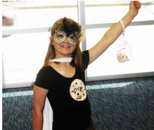
Cookie Girl at our Super Hero Party

It's a mash-up of your favorite creepstastic shows – Supernatural, Walking Dead, and Vampire Diaries. Come dressed in character if you dare. We'll celebrate all things creepy by making and decorating SuperZombieVamp survival kits while watching a creepster classic.