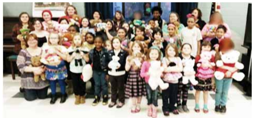
Photo from Kenmore Service Unit Teddy Bear Tea Party – February, 2015

Get involved and form your own troop and experience the fun and adventure of being in Girl Scouts. Sign up today at www.gsneo.org or come to our sign up night with any questions, and sign up there. We are always happy to help and would love to welcome you on board. Applications for girls and leaders will be accepted for all grade levels starting with Daisies (grades k-1).