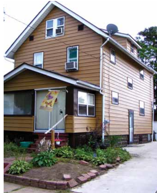
Area Home After Project Shine

This year's project served about two dozen residents, dodging raindrops along the way. We are pleased to report that God gave us the people and the weather we needed to complete the projects we committed to for the week. Project Shine is a non-profit group which collaborates with several different churches in the area.