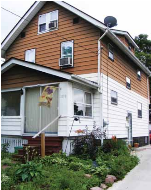
Before View of Area Home

From June 21st through the 26th, Project Shine hosted its annual work week in the Kenmore and Ellet Communities in Akron. Fifty-five teenagers and well over one hundred total volunteers blessed homeowners with basic home improvements including yard work, painting, staining, and general clean up. Students each raise $175 and give up their week of summer to serve with the project. Adults sacrifice anywhere from a day to a week as servant leaders in various capacities.