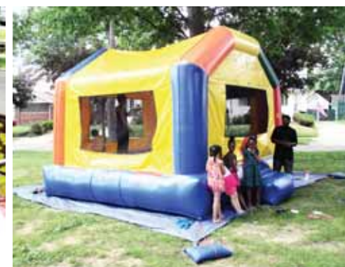
Kiwanis Members Help Out at the Family Event