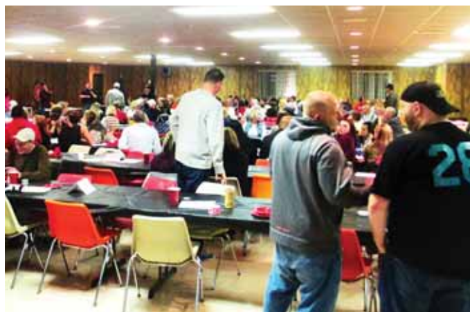
Last Year's Fundraiser at the VFW Post

The Kenmore Athletic Booster Club will hold their Second Annual Spaghetti Dinner fundraiser on Saturday January 28th at the Firestone VFW Post #3383 at 690 West Waterloo Road. This is an opportunity for the Kenmore Community to come out and support the Kenmore Middle School Football Program. In addition to the purchase of a spaghetti dinner, you can donate to the program by purchasing tickets to the Chinese Auctions that night, or purchase tickets before hand for the Grand Prize Drawing (to be announced, but last year's was a 60-inch Color TV).