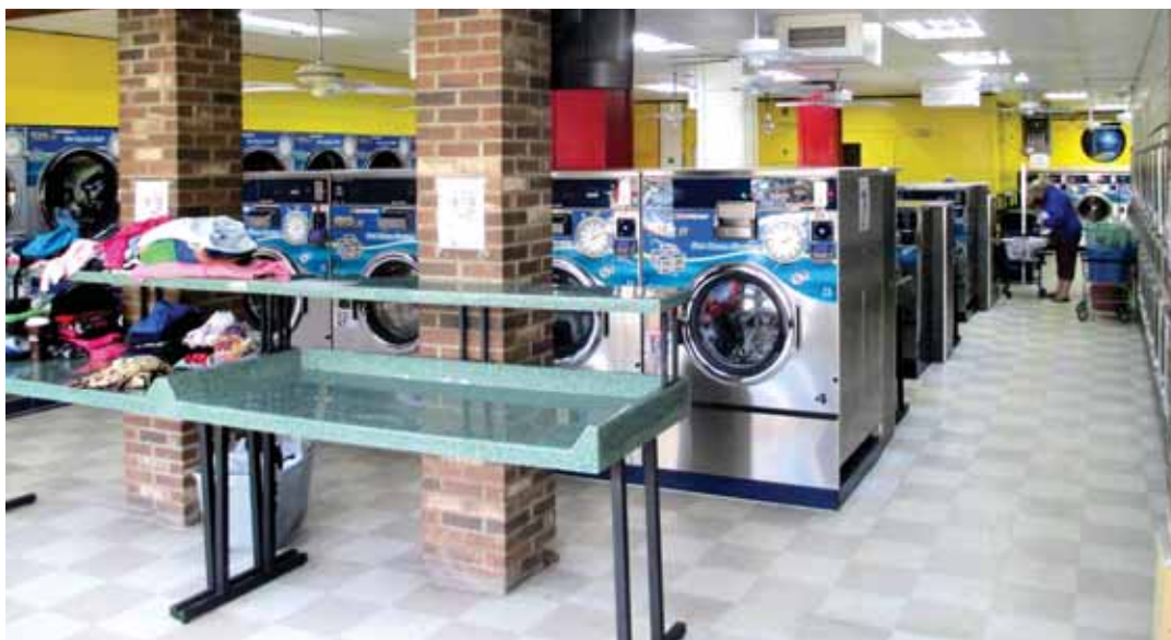
Newly Remodeled Spin City, Located at 2376 East Avenue

Spin City is located next to the Kenmore US Post Office at 2376 East Avenue. Stop by and see for yourself how doing your laundry just got better!