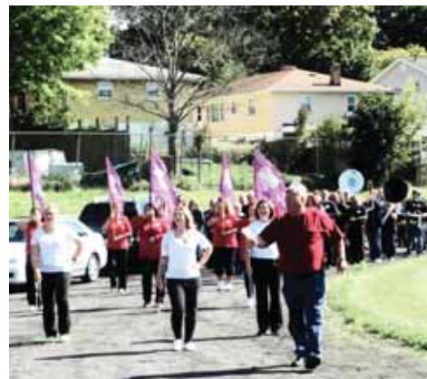
Past Kenmore Band Grads Parade Around the Field...