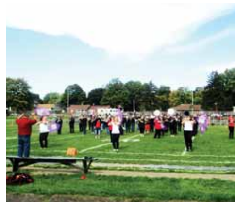
...and Still Play Great Music at Half-Time!