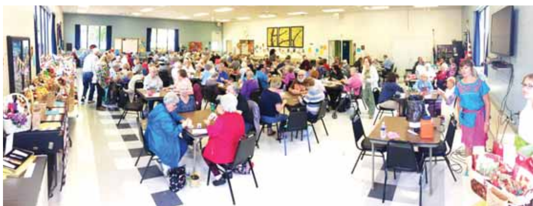
A Packed Room at the October 8th Card Party