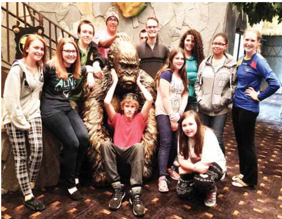
Student Leaders at the First Glance Student Center

We see so much potential in our student leaders, and constantly want to lift them up in their everyday lives. We encourage them to speak words of life, and to strive to be a positive influence amongst their peers. Our desire is for the student leaders to be able to live lives of selflessness, to be able to overcome life's challenges together, to love and treat others well, and to develop into leaders within First Glance and the Kenmore community.