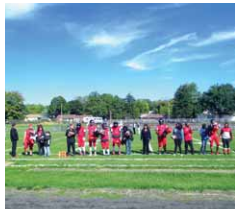
Senior Football Players Introduced with Family