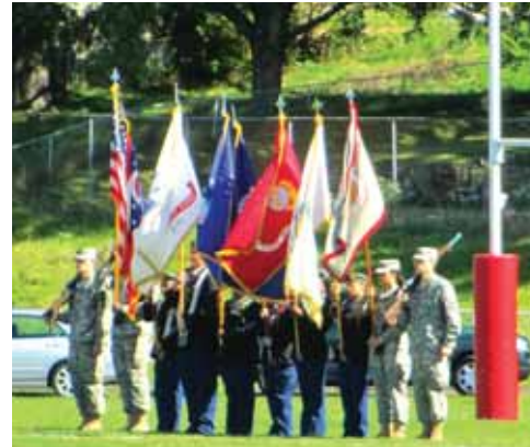
Kenmore ROTC Presents the Flags