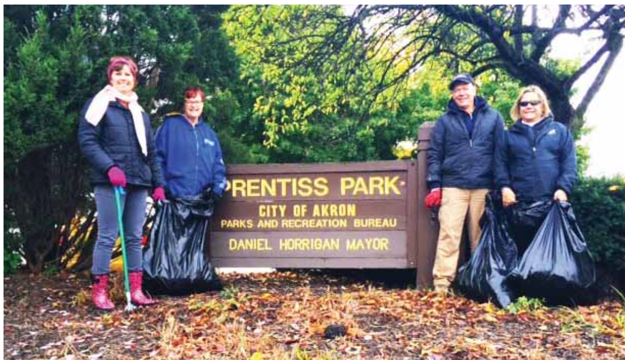
Volunteers Help Clean-Up Prentiss Park

Saturday October 22nd was a cold & dreary day, but a handful of brave people headed out with trash bags in hand to clean up Prentiss Park and the empty lot across from the Kenmore Community Center. The clean-up project was part of the “My Neighborhood Our Akron” initiative to beautify each ward in Akron through the Department of Neighborhood Assistance. The “My Neighborhood Our Akron” initiative also encourages community members within their neighborhoods to become active with the beautification and clean up processes. “My Neighborhood Our Akron” meets monthly in the different community centers city wide throughout the year. The clean-up also just happened to fall on “Make a Difference Day”.