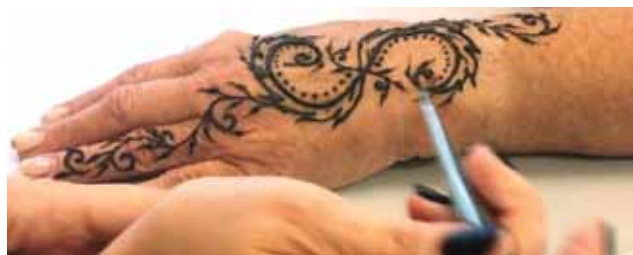
Kenmore Henna Tattoos

Create a poetic piece of art from pages torn out of books!