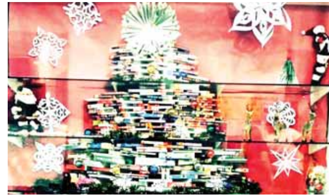
Kenmore Christmas Tree

Join us for games, pizza, prizes and fun! Bring the whole family for some old school fun with all types of games for all ages. Come beat your parents and grandparents on the games they used to play, like Twister and Rock'em Sock'em Robots and at games on the vintage Atari and Nintendo 64 systems. We have a large selection of other games as well, including Connect Four, Boggle, Operation, Kerplunk, Don't Break the Ice, Barrel of Monkeys and many more.