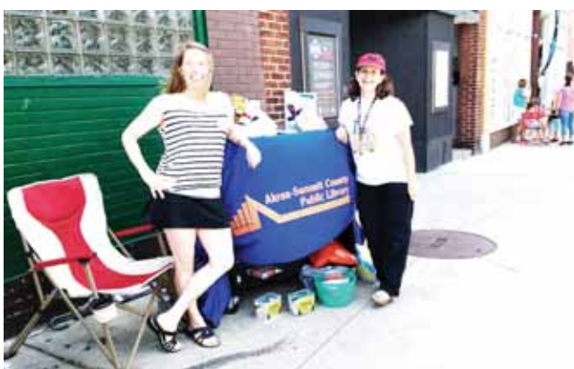
Kenmore Branch Library