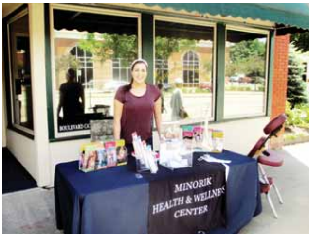
Minorik Health & Wellness Center