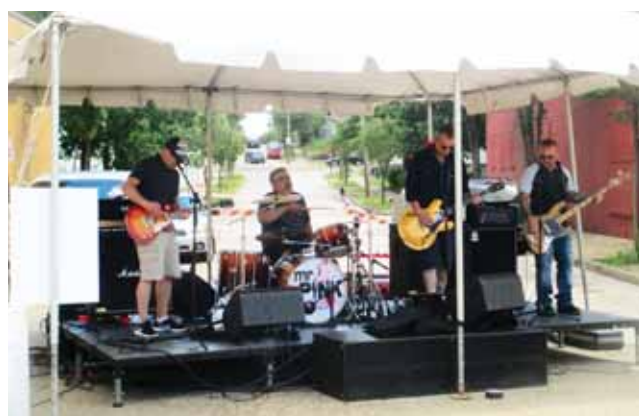
Music all Day next to Pierre’s Pizza (above) and Fans Who Listened (below)