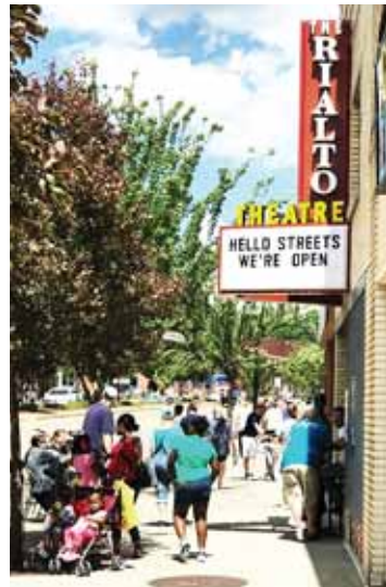
The Rialto Theatre