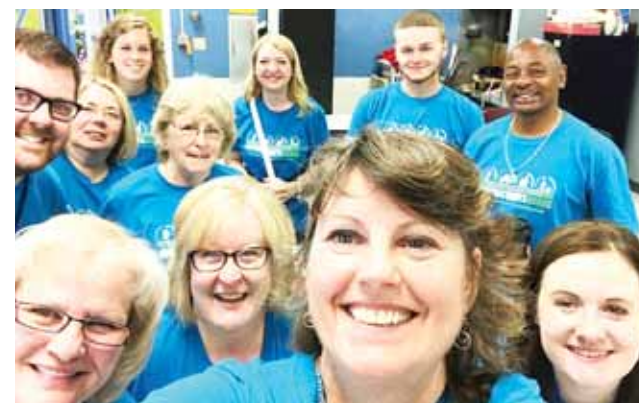
Alice & the Kenmore Community Center Volunteers (above) and the Information Center (below)

Open Streets Akron 2017 encouraged local businesses and organizations to work together to showcase Kenmore and realize our potential for future events like Better Block, scheduled for September 1st & 2nd 2017.