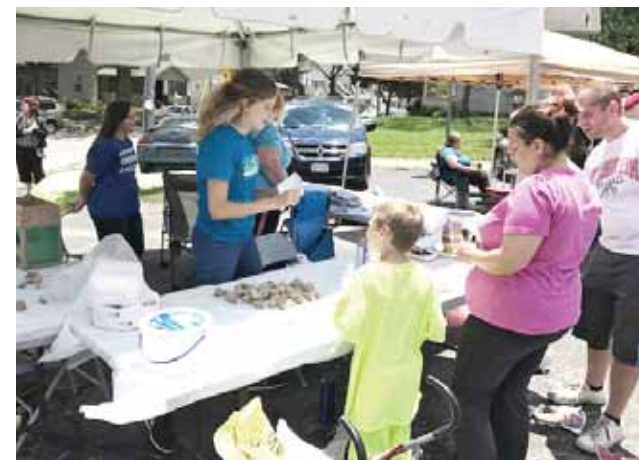
Children Painted Their Own Rocks (above) or Looked on the Boulevard for the Cardinal Rocks (below)