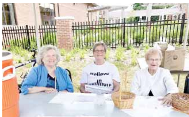
Kenmore Senior Club (above) and the Humane Society Mobile (below)