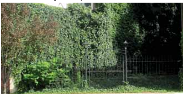
Future Beer Garden? Find Out Soon!