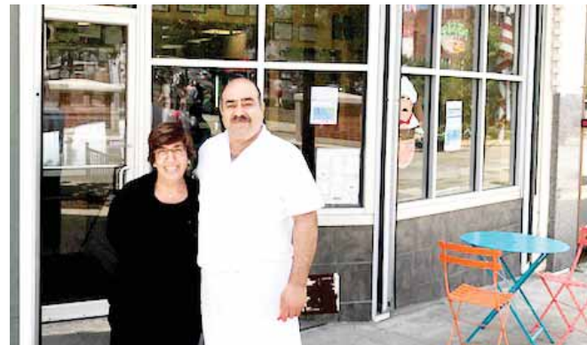
Pierre's Brooklyn Pizza & Deli