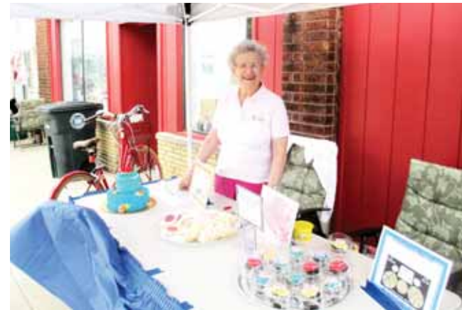
Reeves Cake Shop