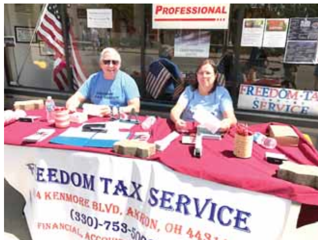
Fredon Tax Services