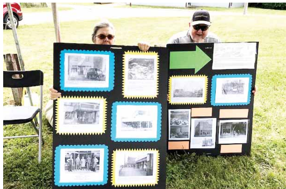
Historical Photos on Display at Open Streets Akron