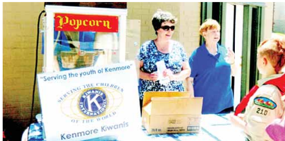
Kiwanis gives free popcorn at Akron Open Streets