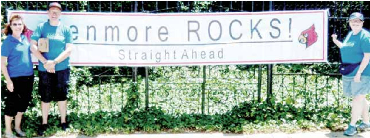
Kenmore Neighborhood Alliance with Their "Rocking" Banner

Here are some of the Businesses & Organizations who Participated (sorry we could not list you all) - Thank You!