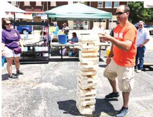
Park United Methodist Church (background)