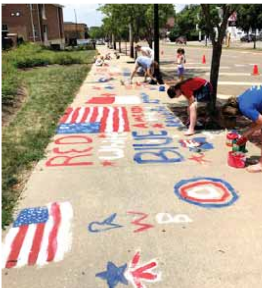
Patriotic Sidewalk Painting

Monday July 2nd was probably one of the hottest days of this summer. But for the brave children and their caregivers who came out, the painting party was an opportunity to express their patriotism. And that they did! Splashes of red, white and blue quickly dried onto the hot sidewalks in front of the Kenmore Community Center while older adults peered out the front windows from within the cool building. Stars, stripes, and phrases of freedom were emblazoned just in time for our nations birthday. The children didn't seem to mind the scorching heat as they ran to get more paint or a different color in order to add more creative detail to their cement "canvas". We look forward to making this an annual event and lining the entire sidewalk of Kenmore Boulevard between 11th & 12th Streets with words & visions of patriotism.