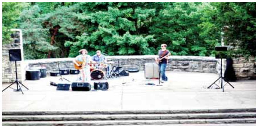
A Live Band Plays at the Amphitheatre at Chestnut Ridge