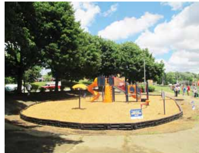
Playground Finished at 2:00 pm