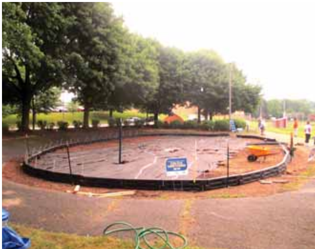
Playground workspace at 9:00 am