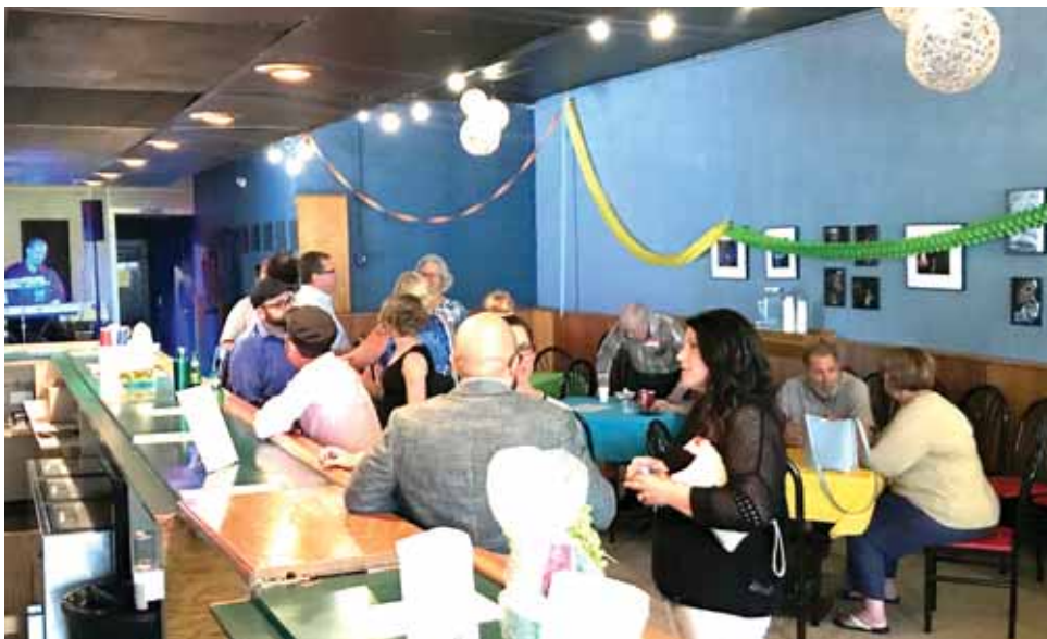
Dessert Party at the Live Music Now! Venue

Please consider adding your time and resources to Akron Promise, as they continue to grow and expand opportunities for Kenmore-Garfield students. The continuation of the scholarship is made possible, in part, by the generous contributions of these local Kenmore businesses: Beneficial Building Services, The Guitar Department, Showcase Meats, Kenmore Komics & Games, and Olde '97 Cafe. Please support these businesses, as they support our youth.