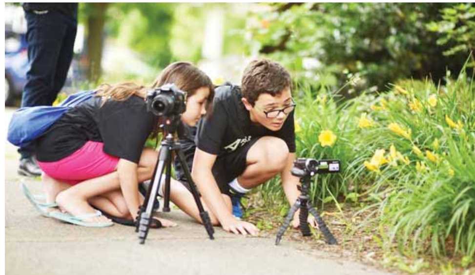
Kenmore Children Helped Blue Green Film in Kenmore

You can follow us on facebook at KenMore Kreative or catch us on the web at www.kenmorekreative.com . If you are interested in doing more, we would love to have you on our KenMore Kreative team. Send us an email at kenmorekreative@gmail.com and be a part of all the fun in Kenmore today.