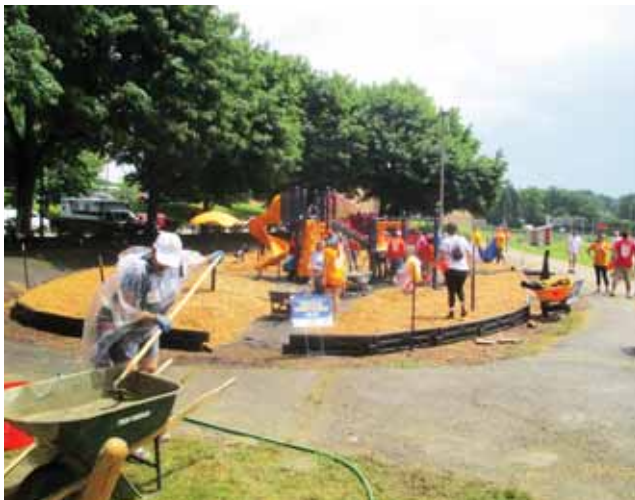
Playground workspace at 12:00 pm