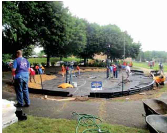
Playground workspace at 10:00 am