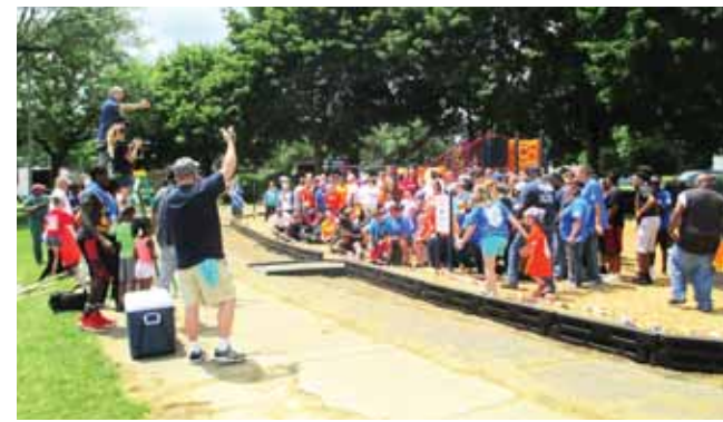
Volunteers Line-Up for Group Photo

It was truly a neighborhood effort. Stay tuned for special events scheduled throughout the year to highlight this wonderful addition to our community!