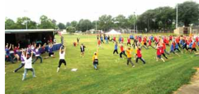
Yoga Warm-Up Before Starting