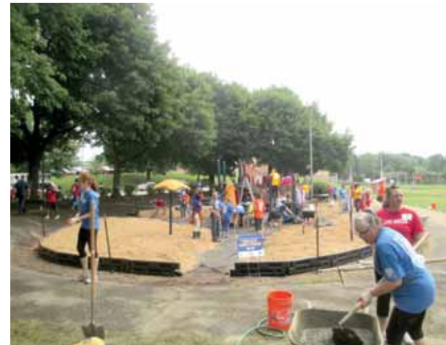
Playground workspace at 11:00 am