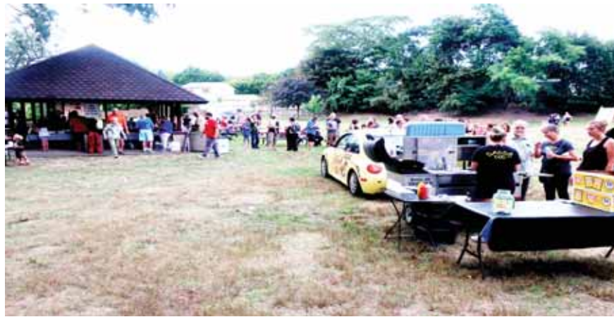
A Large Crowd at the August 7th Councilman's Picnic

August 7th was a great day for the 17th Annual Councilman's Picnic at Chestnut Ridge Park. A very large crowd of Kenmore/Ward 9 residents enjoyed food, music, children's games, and information presented by quite a few community groups. These included the Kenmore Historical Society promoting their future museum, United Way promoting the C.A.R.E. Mentor Program for Akron Public Schools (visit www.uwsummit.org/mentor for more information), Summit County Children Services promoting their Summit Kids Levy on November 6th, the Kenmore Neighborhood Alliance showcasing their "Reimage Kenmore Boulevard" display, and KenMore Kreative. Also in attendance were The Church on the Boulevard & Park United Methodist Church, co-sponsors of the Akron Parks Collaborative.