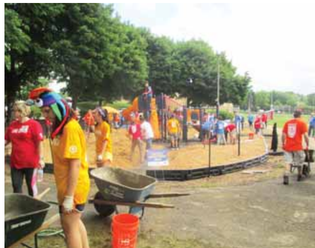
Playground workspace at 1:00 pm