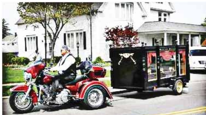
Only Motorcycle Hearse in Summit County