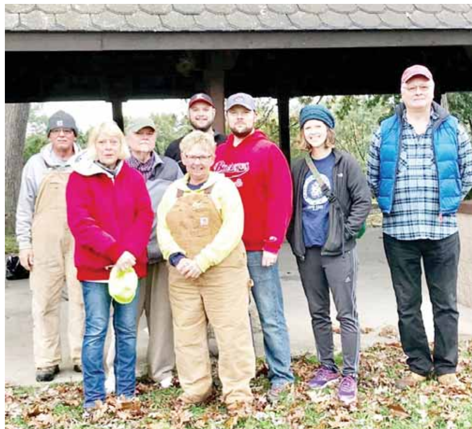
Volunteers for the Chestnut Ridge Park Clean-up (above) and the beautifully cleaned Amphitheater (left photo)