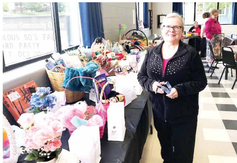
Raffle Baskets Ready for the 30th Annual Senior Card Party

The Kenmore Senior Club held their 30th Annual Card Party on Saturday October 20th. 127 guests from all over the city and surrounding areas enjoyed the Fabulous 50s themed event. They were treated to Bob's Hamburgers & French Fries, an ice cream bar sponsored by Care Source, a jukebox selfie booth flowing with 50s music, raffle baskets, a 50/50 raffle and 2 money trees (made into dice). Before the event, Senior Club members were asked to bring in photos of themselves from the 1950s, and to their surprise a rolling slide show and 1950s-inspired vignettes with their pictures graced the windowsills of the community center. Staff from the community center worked hand-in-hand to help make this big fundraiser for the club a huge success.