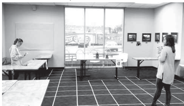
Project Runway Superhero Edition Program

Tuesday, January 8th, 4:00 pm Have a warm bowl of chili after school while we discuss what you would like to see happen for Teens at the library.