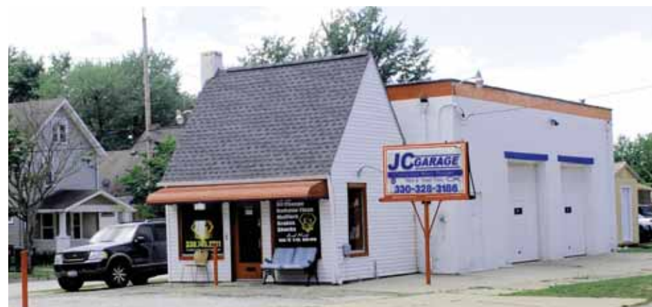
Ramsey's Sunoco Gas Station is now JC Garage

Continuing the story after the 1969 newspaper article "Gals are a Gas":