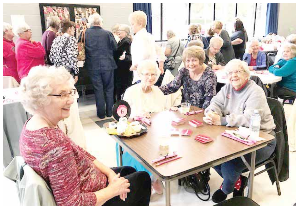
Many Happy Faces at the 30th Annual Senior Card Party