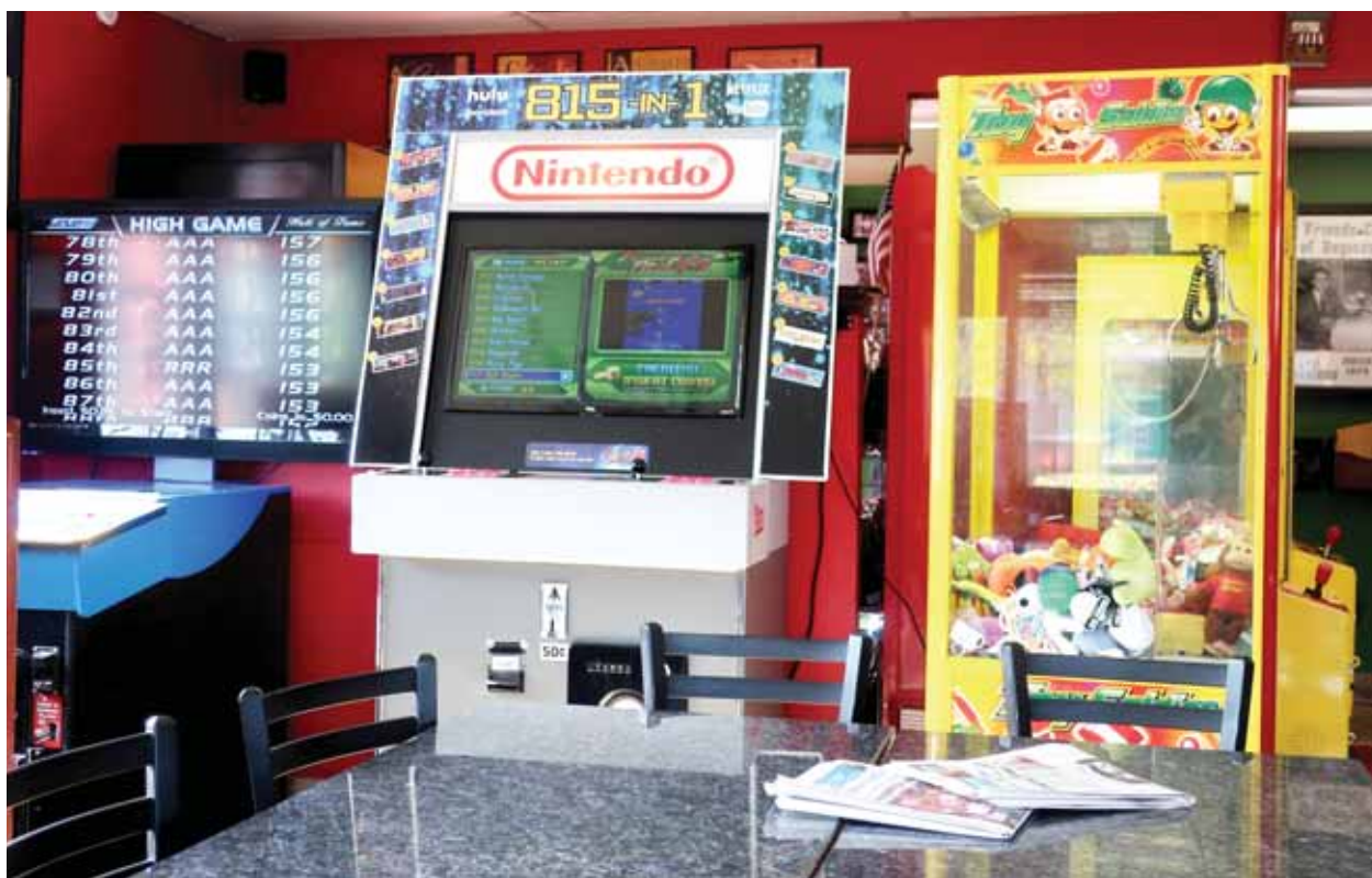
Some of the Fun Family Games at Regina's Pizza, 2160 East Avenue

Regina's Pizza is closed Monday, opens at 11:00 am Tuesday thru Saturday, and opens at 12:30 pm on Sunday. They close when the last customer has been served. For more information please visit them at 2160 East Avenue, call 330-753-7797, or visit their web site at www.reginaspizza.com for a full menu and much more. And while you are there, don't hesitate to play one of the many fun games they have for you and your family!