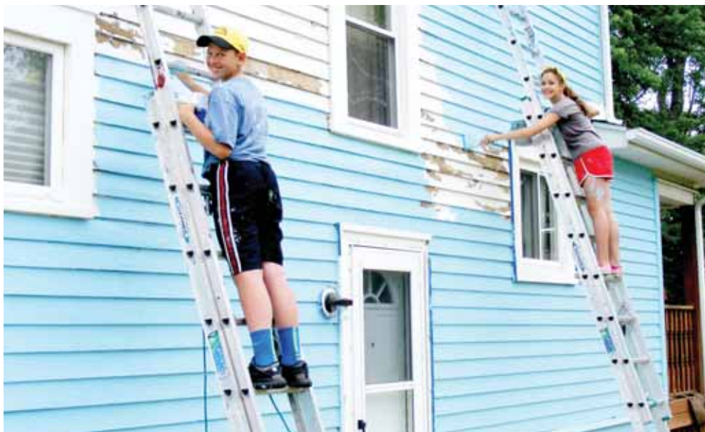
Volunteers at Work During Project Shine 2018