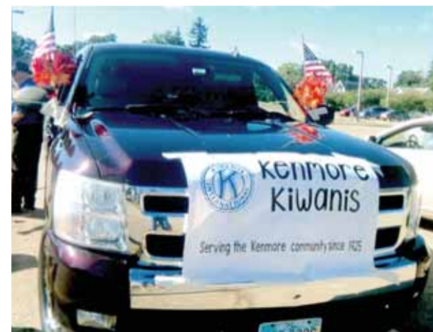
Kiwanis Ready for a Parade

Coming up will be everyone's favorite fundraiser - MIXED NUTS!! They are from Akron's own Peanut Shoppe. Kiwanis will have the one pound decorated boxes for just $8.00 a box. They will be available early November thru mid-December. Contact any Kiwanian to purchase. Proceeds go toward our Thanksgiving and Christmas food baskets.