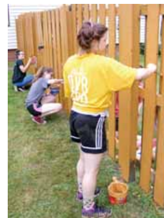
Project Shine Volunteers