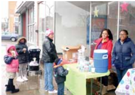
Refreshments on Boulevard