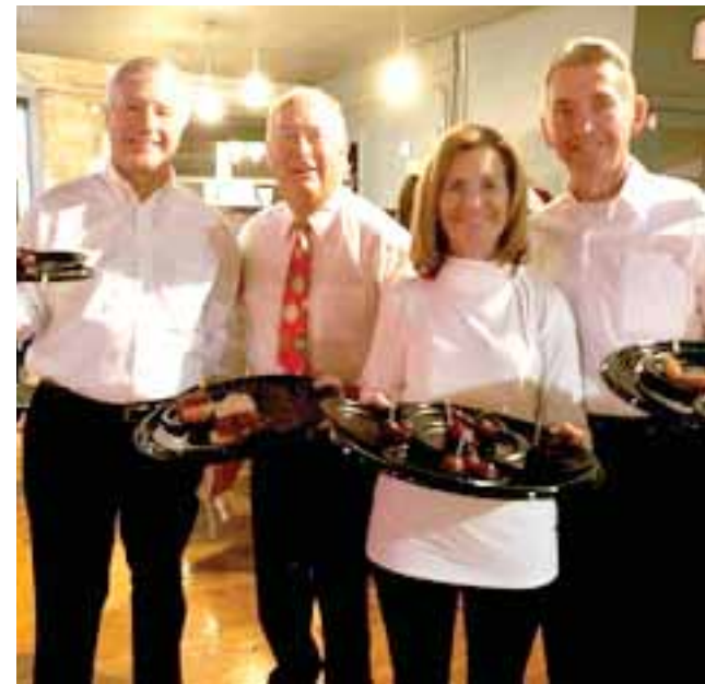
Some Kenmore High School Alumni volunteering their time to serve First Glance Students

First Glance Urban Youth Center has been on Kenmore Boulevard for eighteen years serving students from ages birth to twenty-nine. One amazing thing we look forward to is throwing an annual Christmas party for them. This year's Christmas party was one of the best yet! We had more than one-hundred and seventy-five students come. We had many volunteers connected to civic and religious organizations all throughout Akron come to serve them an amazing meal. We believe our students deserve the best so we make sure the food and service are high quality. One of the highlights of the evening was having some Kenmore Alumni who graduated Kenmore High in the 1960's come and serve our students (pictured to the right- yes we have those serving food dress for the occasion!). The three gentlemen (and wife) in this picture used to call Kenmore their stomping grounds, and now they're supporting First Glance financially and being a presence in a community they've known for years! We're grateful that First Glance continues to be a place in Kenmore where bridges of community are built!