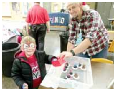
Playing Games at IC