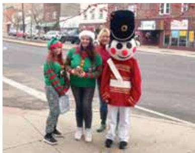
Some of Santa's Helpers