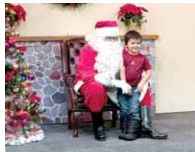
Santa at Park Church