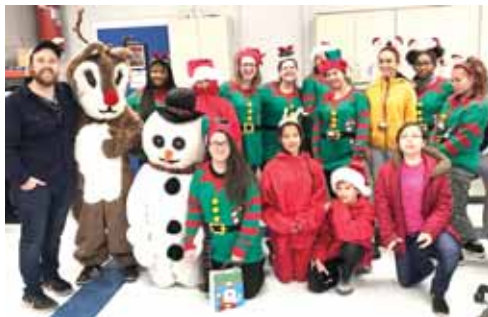
Volunteers Start the Day!

The Kenmore Chamber of Commerce Events Committee coordinated this event, and wishes to thank those groups mentioned above. And special thanks to all our volunteers who contributed time & effort to make this day a big success, and to the Akron Neighborhood Partnership Foundation & the City of Akron for their financial support of this annual event. And please visit those businesses listed on the bottom of this page and thank them for either donating cash or prizes, having a sale or open house, and/or offering free refreshments on this fun-filled day!