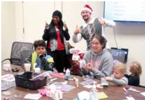
Crafts at Financial Emp Center