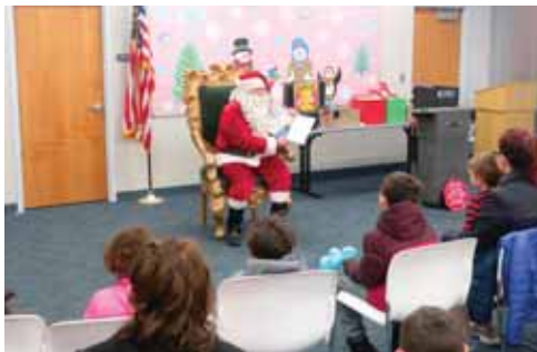
Santa Reads at the Library