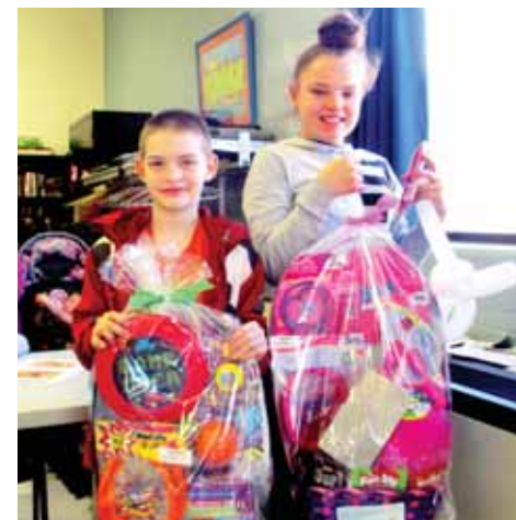
Last Year's Prize Winners

After the Easter Egg Hunt, all are invited to the Kenmore Community Church of the Nazarene (2025 12th Street SW) for their Sixth Annual Easter Carnival. This event, from 12:00 noon to 2:00 pm, will feature a FREE lunch, games, prizes, crafts, cotton candy, and drawings for Easter Baskets! Mark your calendars and please plan to bring your children to this year's Annual Kenmore Craft & Easter Egg Hunt, and then to the Kenmore Community Church of the Nazarene's Easter Carnival, all on April 13th!