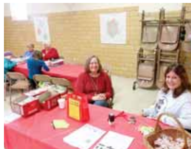
Making Crafts at Park