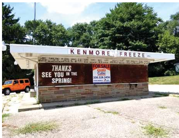
Kenmore Freeze at 2036 East Avenue