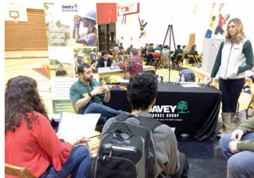
Kenmore-Garfield Students at Career Expo

The Kenmore-Garfield Career Expo, held on January 17th, provided an avenue for approximately 600 9th, 10th, & 11th grade students to explore a variety of career areas to aid them in making an informed decision about their high school plans and career pathways. As opposed to a job fair where students visit companies, the career expo allows companies to present career options for students to explore. While at the fair, students were able interview at least 5 exhibitors, ask questions and participate in hands-on activities. Kenmore-Garfield students will be picking their career pathway in the beginning of February.