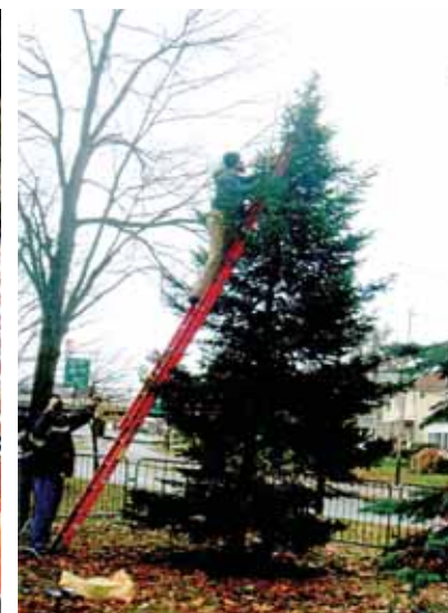
Decorating the Shadyside Park Gazebo (left) and the Big Christmas Tree