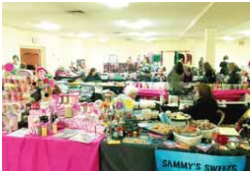
Craft Show at Masonic Temple