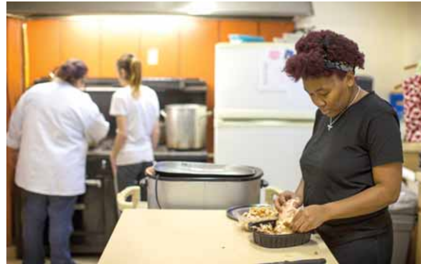
JOBS Program Teaches Culinary Skills

The next six-week culinary training begins February 13th. For more information, please contact JOBS at jumponboardforsuccess01@gmail.com .