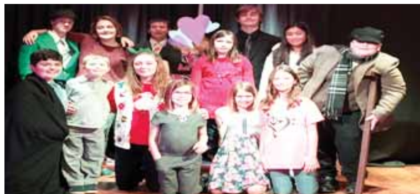
The Cast of Ebenezer's Christmas Carol

KenMore Kreative will be hosting a special "Let's Chat" on March 7th at the Old 97 Cafe in Kenmore starting at 6:00 pm. If you have no idea what KenMore Kreative is all about, or maybe you do and you would like to see if you can get more involved in our organization- this is the time for you to check it out. We will have food, drinks and fun sharing stories and getting to know each other as well as finding a place for YOU. Please contact us if you would like additional information at kenmorekreative@gmail.com or you can find us online kenmorekreative.org or you can find us on facebook.