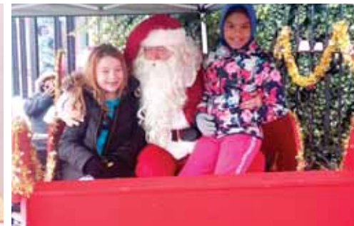
Santa in his Sled with Friends