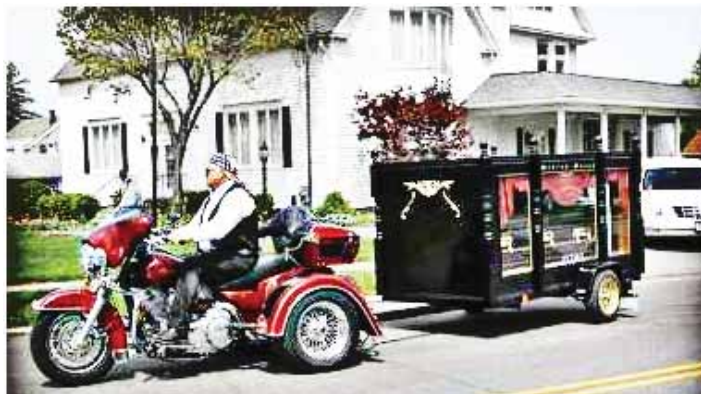
Only Motorcycle Hearse in Summit County