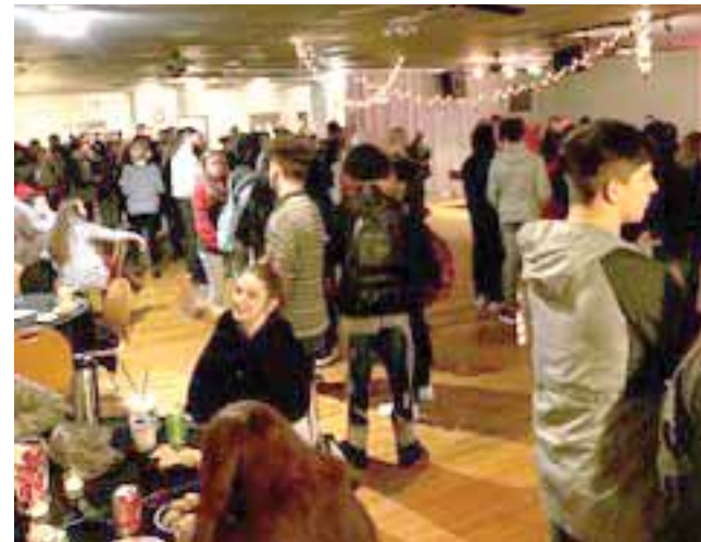
The First Glance Christmas Party was packed with more than one-hundred and seventy-five students!

Park Little Shepherd Preschool has immediate openings for ALL students' ages 3-4 years of age. A new semester has just begun in January! For questions or registration information or to enroll your student, please call the Park Church Office at 330-745-3714.