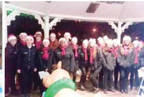
Summit Choral Society