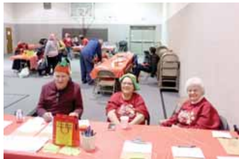
Nazarene Church Volunteers