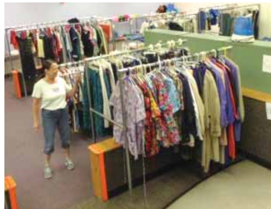
Clothing at The Free Store