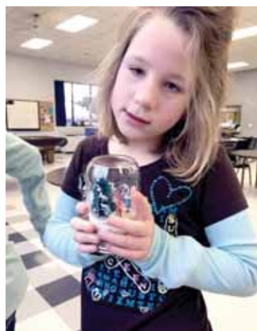
Crafts & Games at the Kenmore Community Center