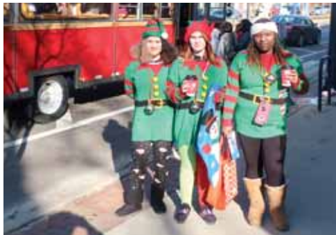
Some of Santa's Helpers