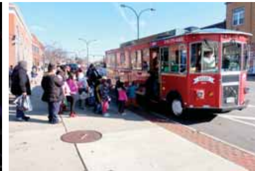
Taking the Trolley