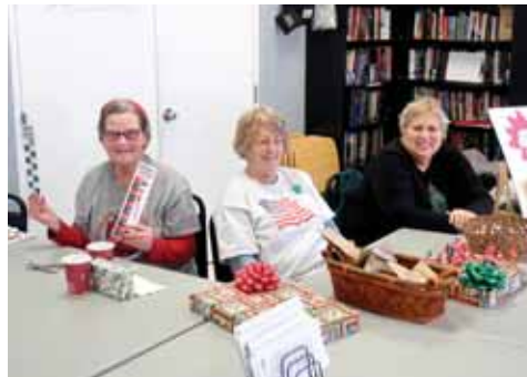
Kenmore Historical Society