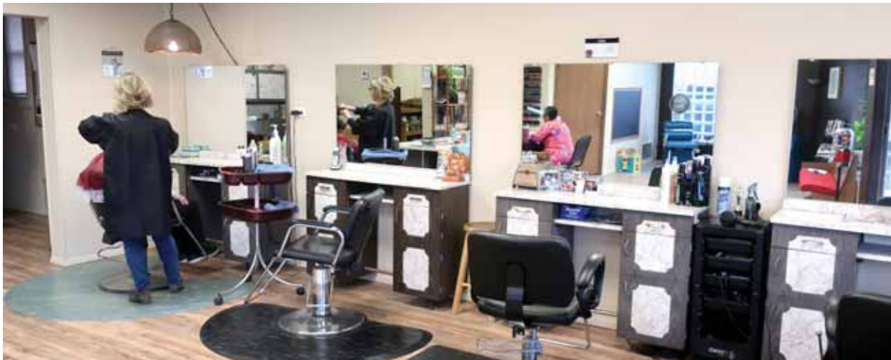
The Newly Remodeled Space at Nikki's Styling Salon

Nikki's still offers hair-cuts, color & perms, waxing, eyelash extensions, manicures and nails, acrylics & jell polish. They are open Wednesday thru Saturday (hours vary) and appointments are encouraged, but walk-ins are welcome if they are not busy. Please call 330-848-1133 for more information or to make an appointment.