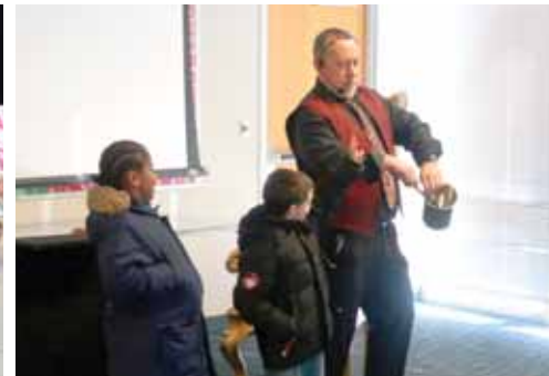
Magic at the Library