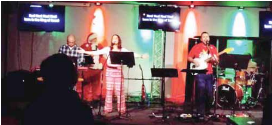
A Band Plays at The Chapel in Kenmore on Christmas Eve

We are a community that genuinely invites all people to take a look at a lifelong relationship with God. We'd love to have you join us sometime on a Sunday at 10:30 am! Go to www.kenmore.thechapel.life to learn more, and take a minute to look up and like our FaceBook page.