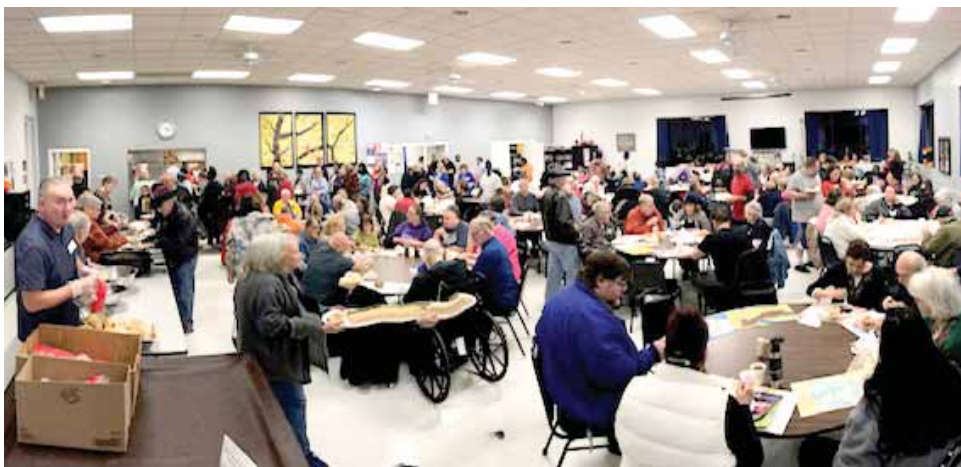
Thanksgiving at the Kenmore Community Center

On Tuesday, November 26th, 2019, the Kenmore Community enjoyed a free home-cooked Thanksgiving meal sponsored by the Kenmore Ministerial Association at the Kenmore Community Center, where a record-breaking 701 meals were served. This free annual event brings hundreds of people from the area and has become an event that everyone looks forward to, not just for the delicious food, but also to come together in true community spirit. With months of planning, volunteers young and young-at-heart made this annual event an effortless one that folks will always remember.