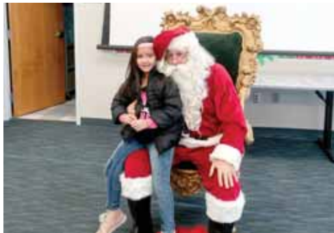
Santa Reads at the Library

The Kenmore Chamber of Commerce Events Committee coordinated this event, and wishes to thank those groups mentioned above. And special thanks to all our volunteers who contributed time & effort to make this day a big success, and to the Akron City Council Neighborhood Partnership Grant & the City of Akron for their financial support of this annual event. And please visit those businesses listed on the bottom of this page and thank them for either donating cash or prizes, having a sale or open house, and/or offering free refreshments on this fun-filled day!