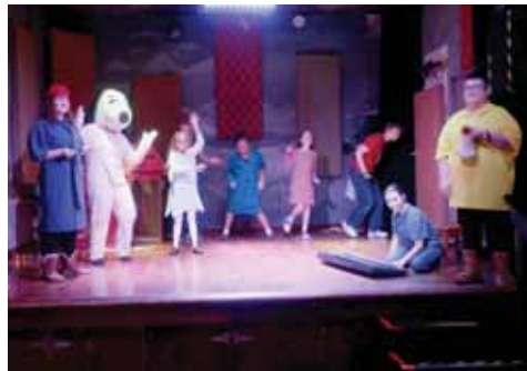
Peanuts Play at Rialto Theatre