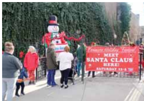
The Line to See Santa