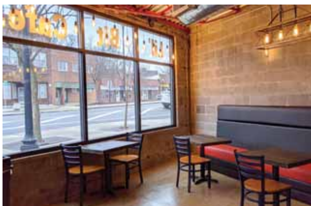
The Interior of Lil' Bit Cafe

"Lil' Bit Cafe is open at 992 Kenmore Boulevard Monday thru Saturday, 11:00 am to 9:00 pm with expanded hours starting in the spring. For more info, catering, and to-go orders, please call 234-718-2233.