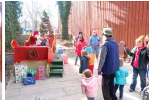
Santa in the New Courtyard