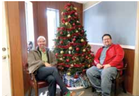
A-Z Insurance Open House