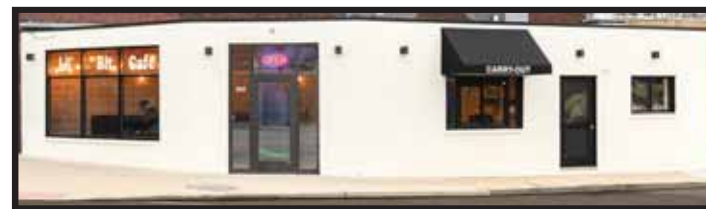
Located at the corner of Kenmore Blvd. & 15th Street

Ask us about Catering and Special Events!