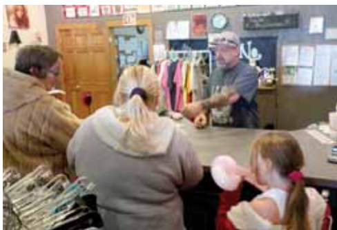
New Beginnings Greets Visitors