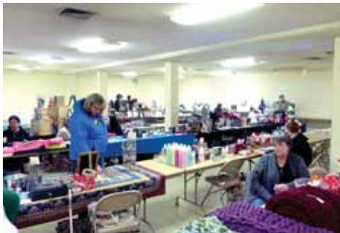
Craft Show at Masonic Temple