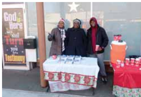
Refreshments on Boulevard