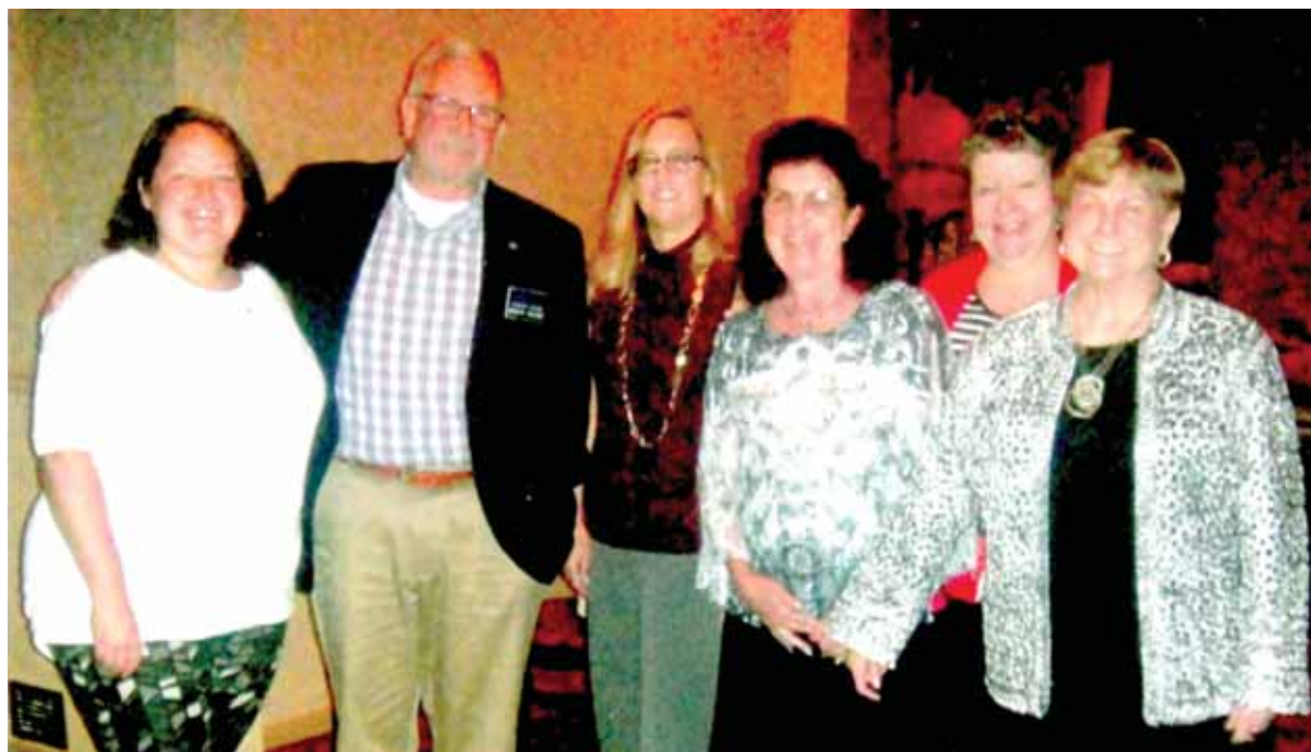
The Officers & Directors of the Kenmore Kiwanis Club