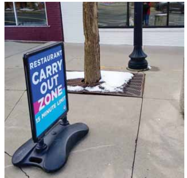
Carry Out at Lil'Bit Cafe

With public gatherings on hold, KNA sponsored a virtual First Friday event on Friday, May 1st featuring live music from The Guitar Department and The Rialto Theatre, demos by Lay's Guitar Shop, Lil Bit Café, Kenmore Komics & Games, and the Kenmore Branch Library, plus stories of local rubber workers and their families. For updates on First Fridays and Boulevard business specials, follow KNA at facebook.com/betterkenmore . And, most importantly, support our Kenmore businesses!