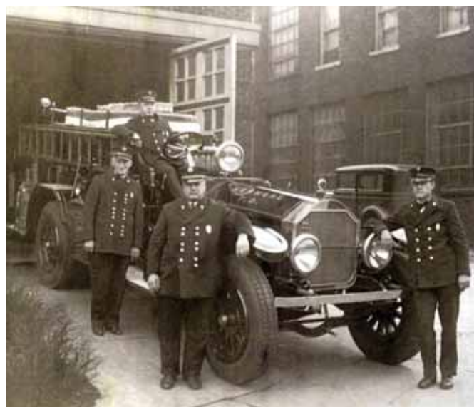
The Original Kenmore Fire Engine Demolished and Rebuilt in 1927