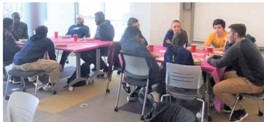
Kenmore-Garfield High School Students on a Field Trip