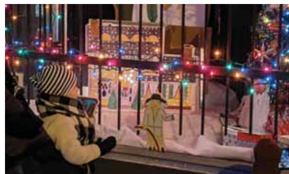
Kenmore Boulevard Trees and Storefronts Come Alive with Lights