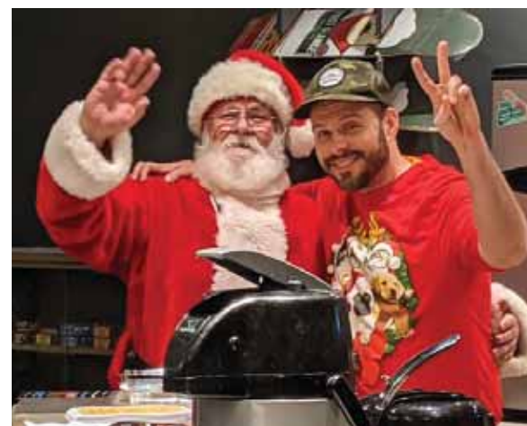
Santa Will be on Hand for Pictures on December 2nd

Kenmore’s newest live music venue, Buzzbin Art Music & Shop, will host a holiday sing along with Rubber City Ukes and Missile Toe, “the world’s greatest Christmas band”. In addition, The Rialto Theatre will host night one of its second-annual Kenmore Winter Break Music Festival. Other musicians will perform in select shops, and Santa Claus will be on hand for pictures and to spread some holiday cheer to families.