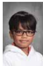
"Don't think you can't do it. Move ahead and ignore bad things people say." - Jeya Nyi