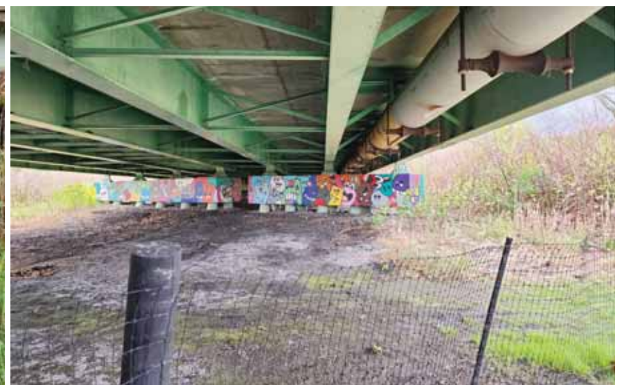
Under the Kenmore Boulevard Bridge at Summit Lake Before (left) and After (right) Clean-Up