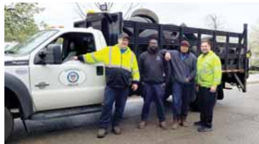
Akron Sanitation Volunteers

This cleanup is one of the largest projects that takes place during Keep Akron Beautiful Clean Up Akron Month. With the help of Keep Akron Beautiful, many of the Walsh High School students getting in some service hours, and many corporate volunteers along with Kenmore and Akron residents, this plan effectively distributed volunteers around the entirety of the lake and zones which were highly littered and in need of this great help from our volunteers. A big "Thank You" to all involved! Summit Lake is beautiful and a source of neighborhood pride for all.