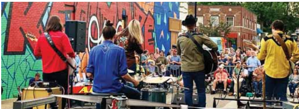
The Shootouts performing during Kenmore First Friday in 2022

Kenmore First Fridays are FREE and presented by Better Kenmore CDC, Kenmore Chamber of Commerce, and the County of Summit ADM Board, with additional support from Akron Civic Commons, Peg's Foundation, Apollo Supply Co, United Way, Kenmore Komics & Games, The City of Akron, The Summit FM, Portage Path Behavioral Health, and Thomas C. Loepp Law Offices. Event information will be posted as it becomes available at betterkenmore.org/first-friday .