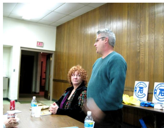
Akron Board of Trade Members in attendance!