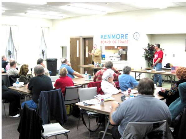
Members enjoying the Councilman’s presentation!