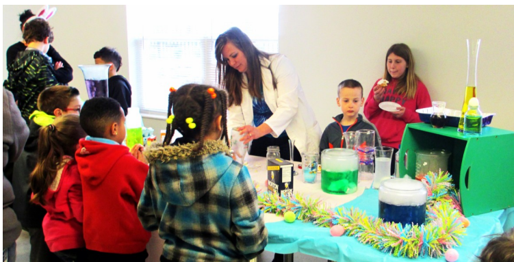
Children do Mad Science Lab Fun