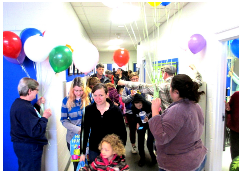
Everyone Gets a Balloon Before the Hunt