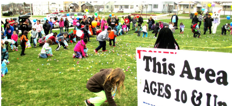
The Egg Hunt Begins While the Easter Bunny Watches (top right)