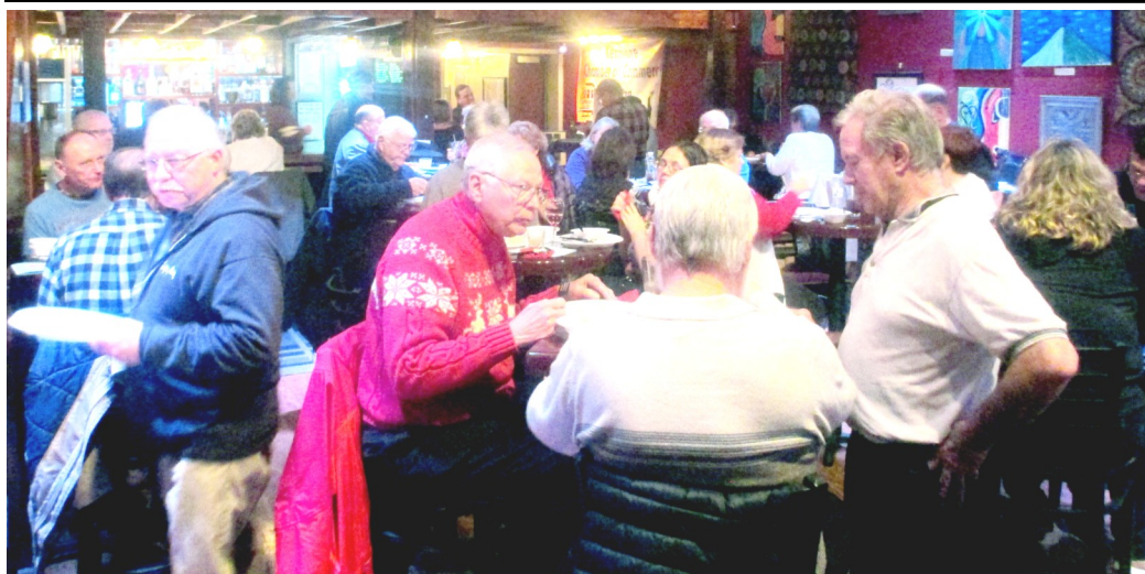
A Large Crowd Attended the KCOC Holiday Party