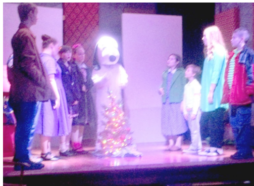
A Scene from "A Charlie Brown Christmas" Play