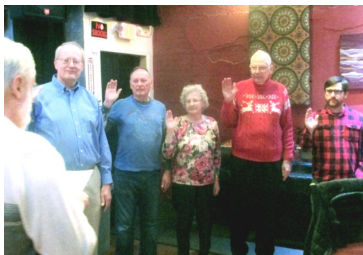
KCOC Officers & Directors Sworn in for 2018