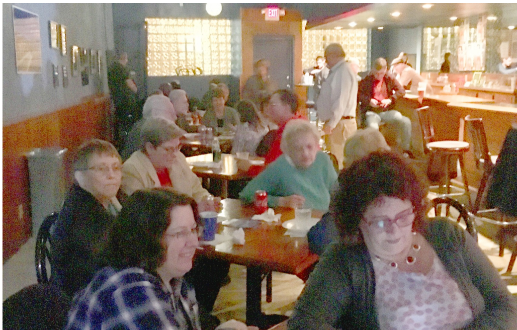
Waiting for Music at the Live Music Now! “Meet & Greet”