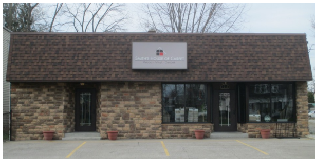
Smith's House of Carpet

This networking event will be from 5:30 to 7:30 pm, and no RSVP is necessary. We hope to see you there at this fun networking event!