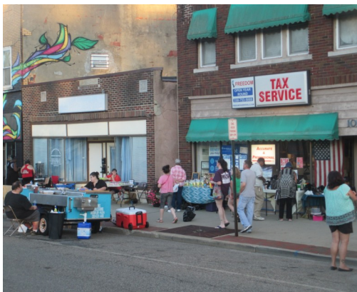
Craft Tables & a Food Wagon at the July 6th Busk Event

Kenmore Boulevard has had several “Busk Until Dusk” events this year on the first Fridays of May, June & July, all sponsored by KCOC member the Kenmore Neighborhood Alliance . They run from 6:30 pm to 8:30 pm, with live music, craft tables, and a food wagon. The next one is Friday August 3rd, between 14th & 15th Streets on Kenmore Boulevard. The last one for this year will be Friday September 7th, between 13th & 14th Streets.