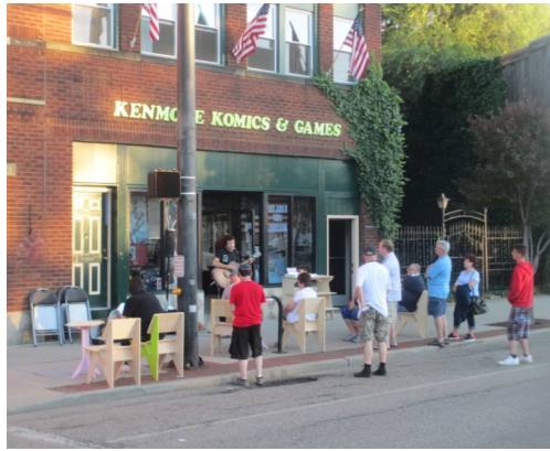
Live Music on Kenmore Boulevard on July 6th