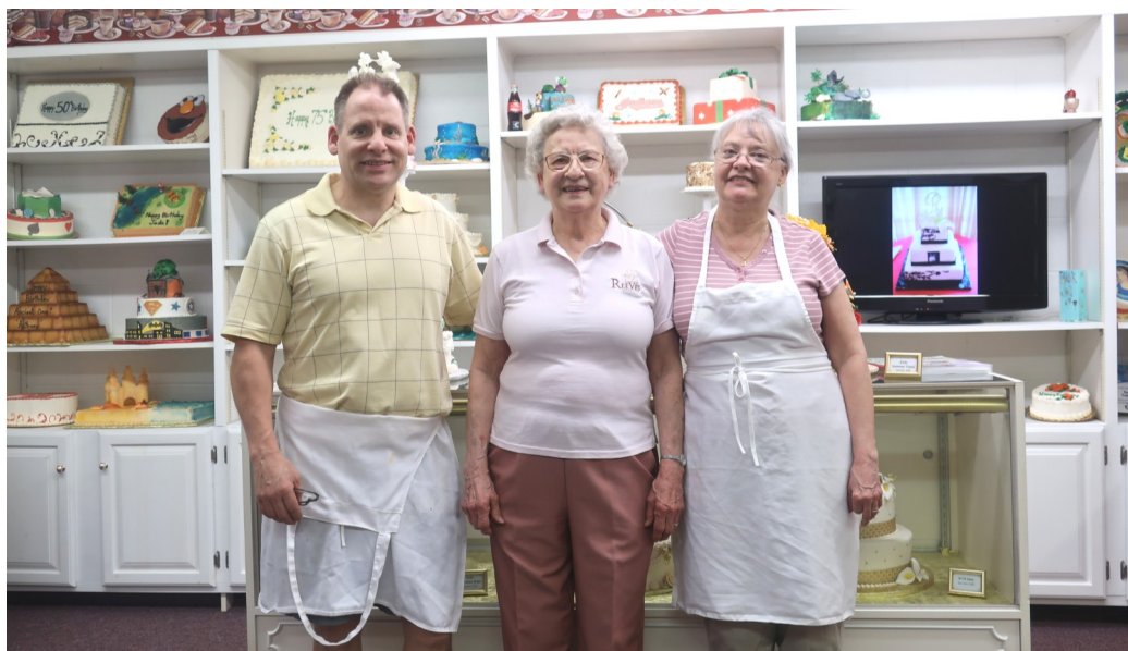
(below) The staff of Reeves Cake Shop!