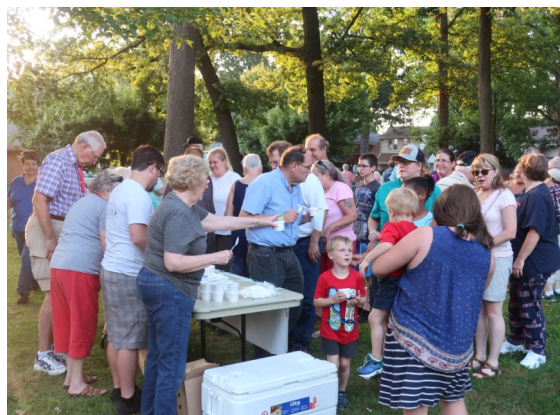
(left photo) Kenmore Chamber Directors (with a helper or two) ready to give away ice cream, and (right photo) concert goes at the July 31st Shadyside Park concert line-up for their free ice cream cups