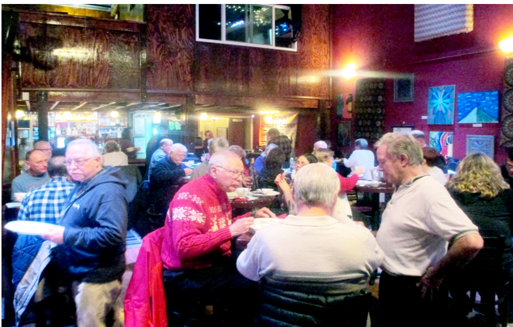
One of Two Rooms to Socialize in at The Rialto Theatre on December 1st!