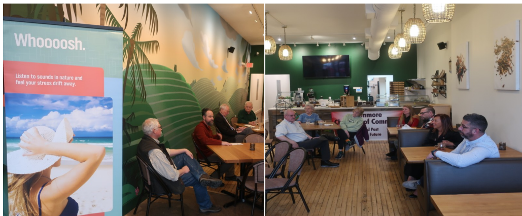
The Anthem Insurance banner “looks on” as Kenmore Chamber members introduce themselves and talk about their businesses in this split photo